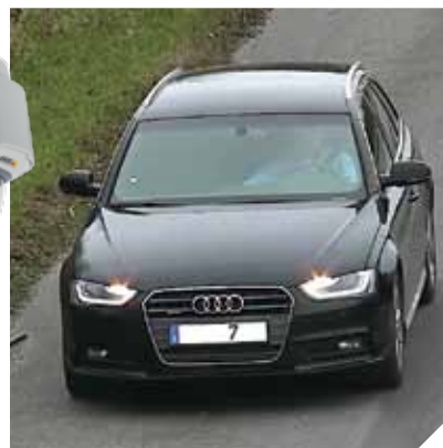
Get valuable incident details in HDTV video quality