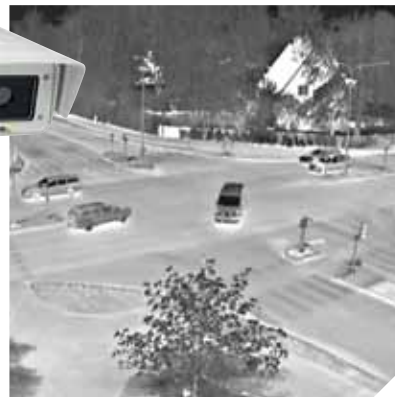
See through complete darkness with Axis thermal cameras